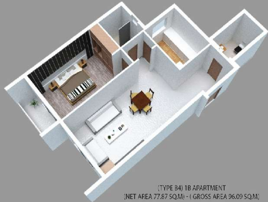
(TYPE B4) 1B APARTMENT (NET AREA 77.87 SQ.M) - ( GROSS AREA 96.09 SQ.M)