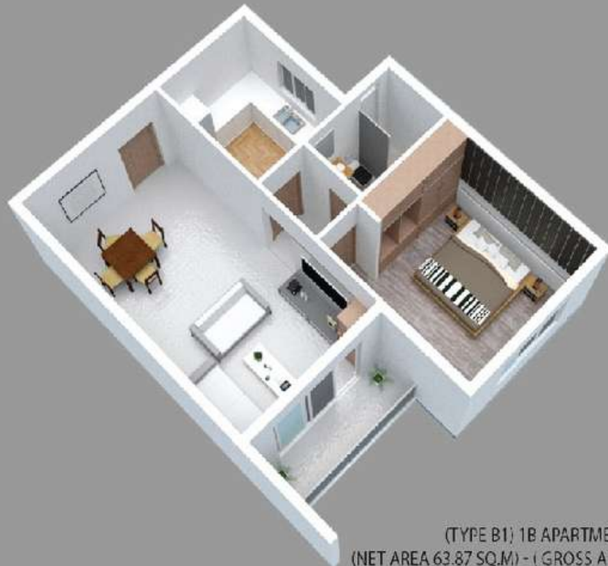
(TYPE B1) 1B APARTMENT (NET AREA 63.87 SQ.M) - ( GROSS AREA 78.81 SQ.M)