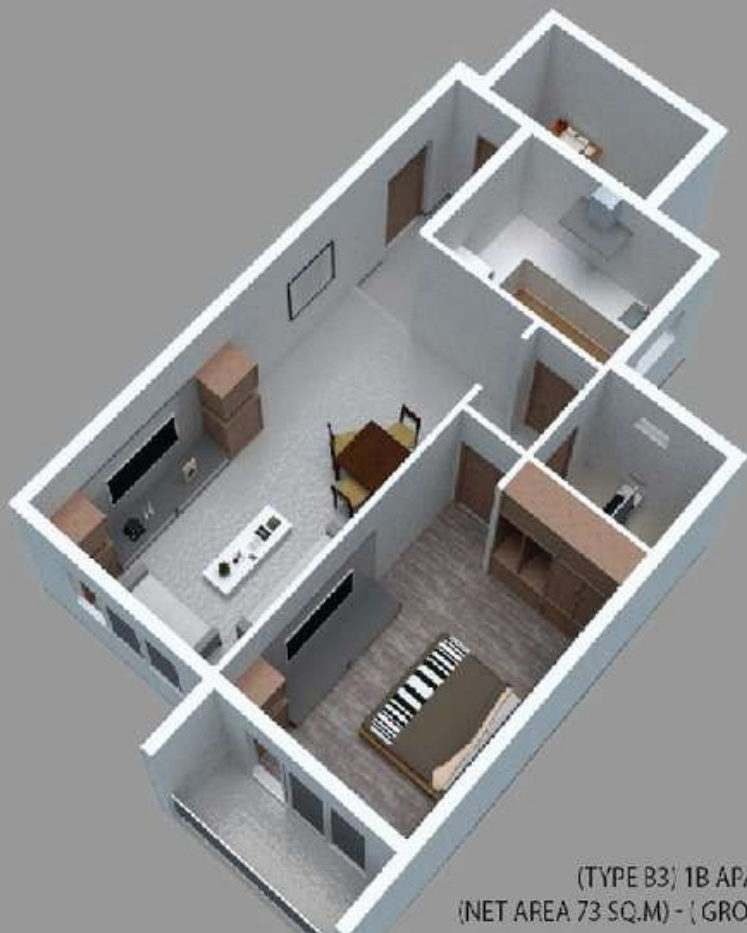
(TYPE B3) 1B APARTMENT (NET AREA 73 SQ.M) - ( GROSS AREA 90.08 SQ.M)