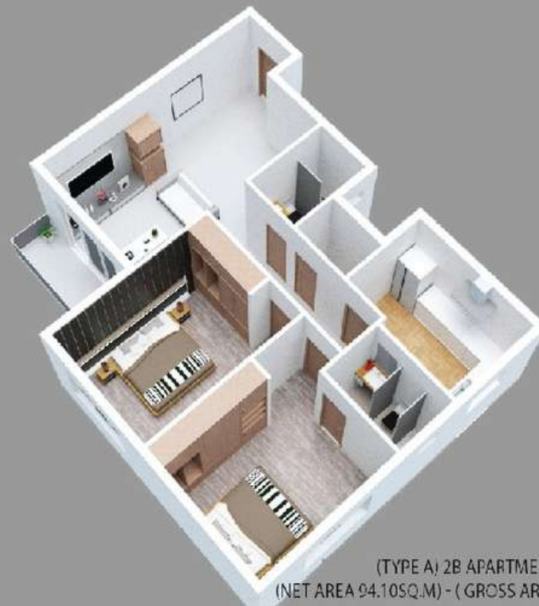
(TYPE A) 2B APARTMENT (NET AREA 94.10SQ.M) - ( GROSS AREA 116.12 SQ.M)